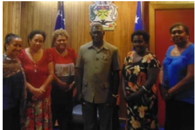
Honourable Prime Minister of Solomon Islands and SIWIBA Executive

She acknowledged that while all the highlights are positive signs of growth for SIWIBA, there is the issue of sustainability for SIWIBA after the funding term lapse in 2017.